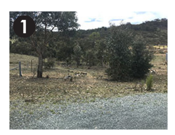
End of Birchmans Grove.