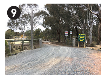
Driveway entrance to Carpark at Bywong Hall, Les Reardon Reserve. Toilet avaliable at Hall.