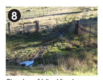
Clare Lane/Valley View Lane. On dirt gated road, closer to Valley View Lane end.