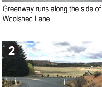
Right turn on to Waramunga