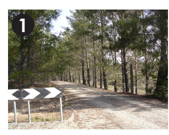
190 Newington Road - take the driveway at the end of the road and through the creek.

Text in Green = Greenway Sign Text in Black = No Greenway Sign