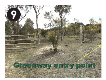
Track starts to right hand side of Kirala (private property) gate.