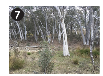
Entrance South side of Birchmans Grove (note not fenced on one side, stay to side with fence).