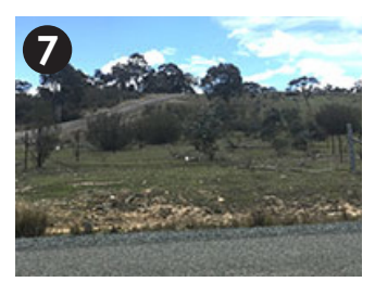
Yuranga Drive, entrance is two properties before McEnally Place.