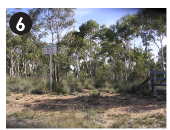
Near 1205 Norton Road.